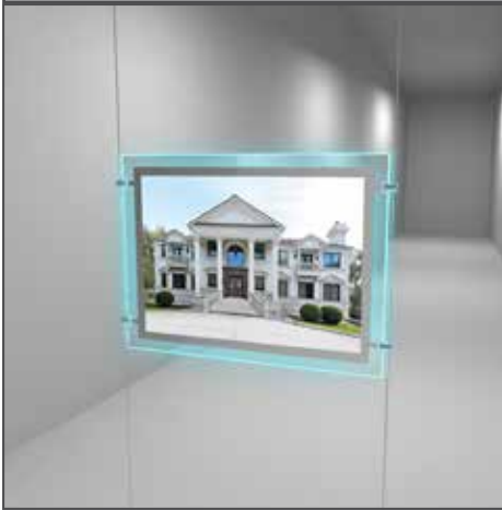
A3 Pocket (Landscape)