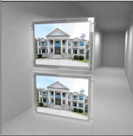
A2 Pocket (Landscape)