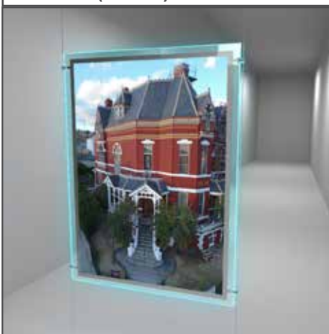
A1 Pocket (Portrait)