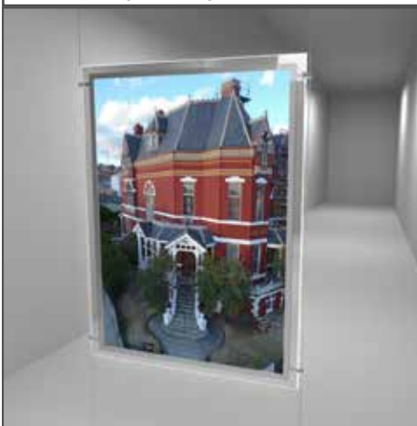
A1 Pocket (Portrait)