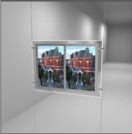
Single Pocket LA4P2W-V5

Overall size 503x380mm to fit cable centres 512mm