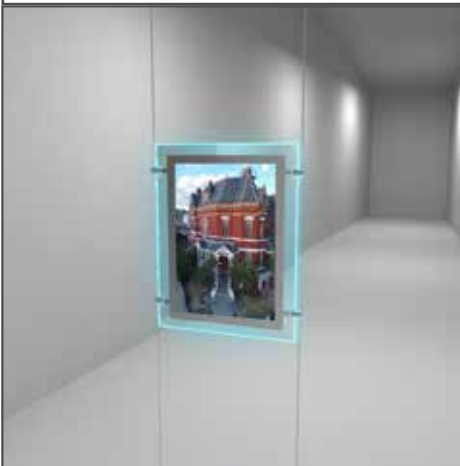
A4 Pocket (Portrait)