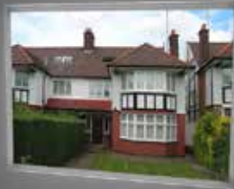
A0 Pocket (Landscape)