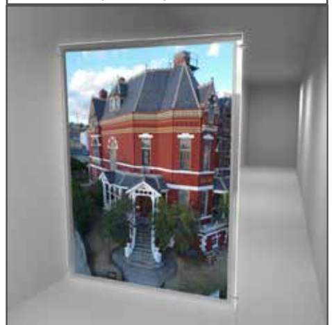
A0 Pocket (Portrait)