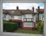
A1 Pocket (Landscape)