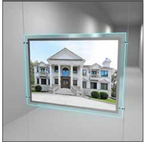
A2 Pocket (Landscape)