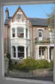
A0 Pocket (Portrait)