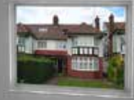
A2 Pocket (Landscape)