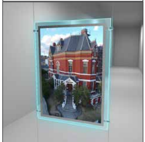
A2 Pocket (Portrait)