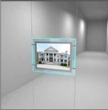
A4 Pocket (Landscape)