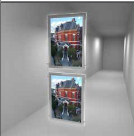
A2 Pocket (Portrait)