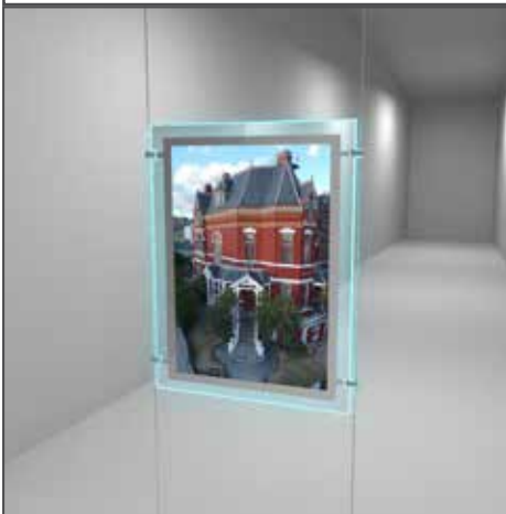
A3 Pocket (Portrait)