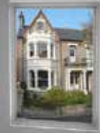
A2 Pocket (Portrait)