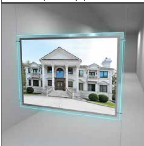
A1 Pocket (Landscape)