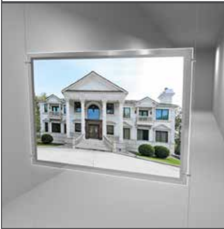
A1 Pocket (Landscape)