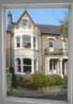
A1 Pocket (Portrait)